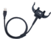
USB snap-on Cable