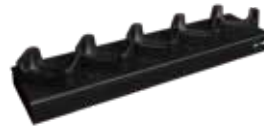
5-slot Terminal Charging Cradle